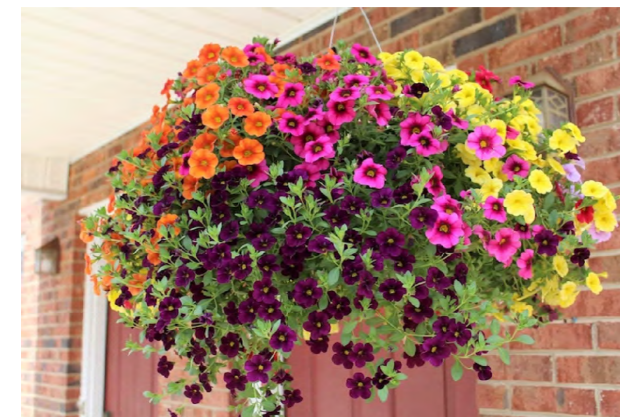
HANGING BASKETS REPLANTED SEASONALLY

The contractor is to check and verify all building and site dimensions, levels, and sewer invert levels at connection points before work starts. This drawing must be read with and checked against any structural or other specialist drawings provided. Any discrepancies found on this drawing are to be notified to STONE ME! DESIGN LTD prior to commencement of work. The contractor is to comply in all respects with the current Building Regulations whether or not specifically stated on these drawings. This drawing is not intended to show details of foundations or ground conditions. Each area of ground relied upon to support the structure depicted must be investigated by the contractor and suitable methods of foundations provided. This drawing is to be read in conjunction with all other standard STONE ME! DESIGN LTD specifications and documentation. STONE ME! DESIGN LTD reserves the right to withdraw any drawings from any applications or third parties should disputes arise between the client and STONE ME! DESIGN LTD. This drawing remains the copyright of STONE ME! DESIGN LTD and cannot be reproduced without prior permission.