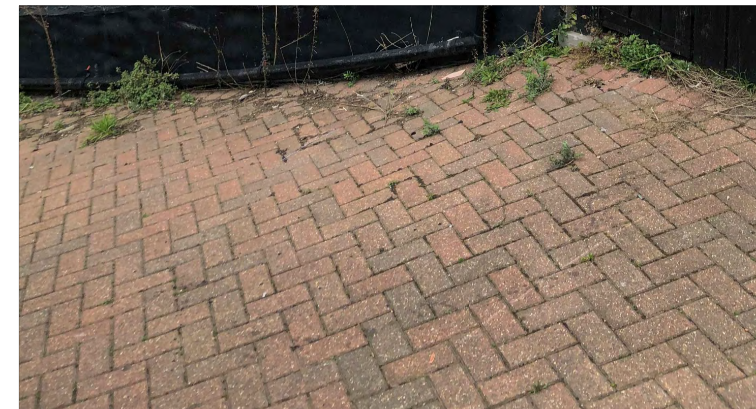
EXISTING HERRINGBONE BLOCK PAVING TO BE CLEANED ANDRE-SEALED