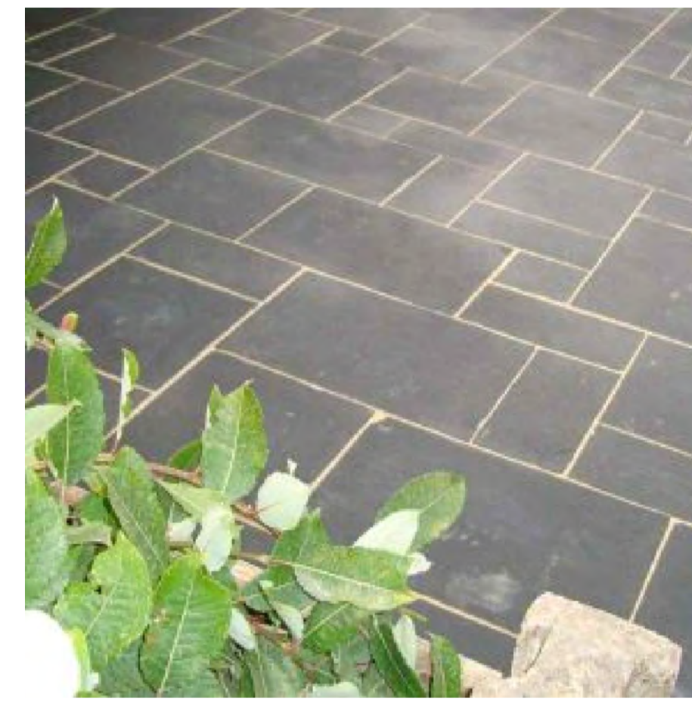
MATT FINISH INDIAN LIMESTONE PAVING